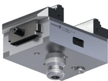
Mounting with quick-change clamping system** **Contact tech support for VERO-S kit