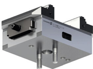
Mounting position arranged with two fitting screws